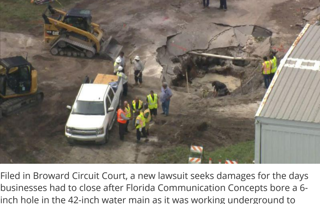
Filed in Broward Circuit Court, a new lawsuit seeks damages for the days businesses had to close after Florida Communication Concepts bore a 6-inch hole in the 42-inch water main as it was working underground to repair electrical lines on July 17.

Five businesses that lost thousands of dollars during Fort Lauderdale’s water shutdown are suing Florida Power & Light Co. and a contractor that drilled into a critical water main.